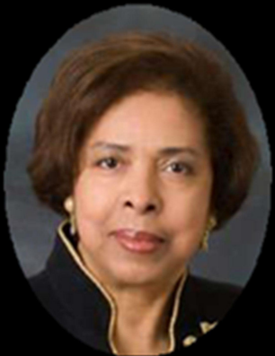
Mistress of Ceremonies

National President Emerita of the National Congress of Black Women, Inc., International President of the Dick Gregory Society, Presidential Scholars Commissioner for President Barack Obama